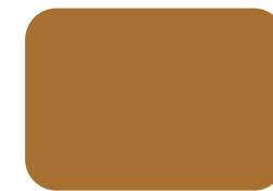
YL86 Cat Yellow