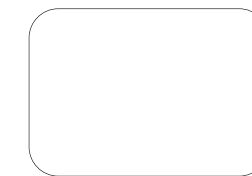
WH12 Gloss White