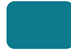
BL05 Light Blue