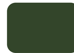
GN293 Container Green